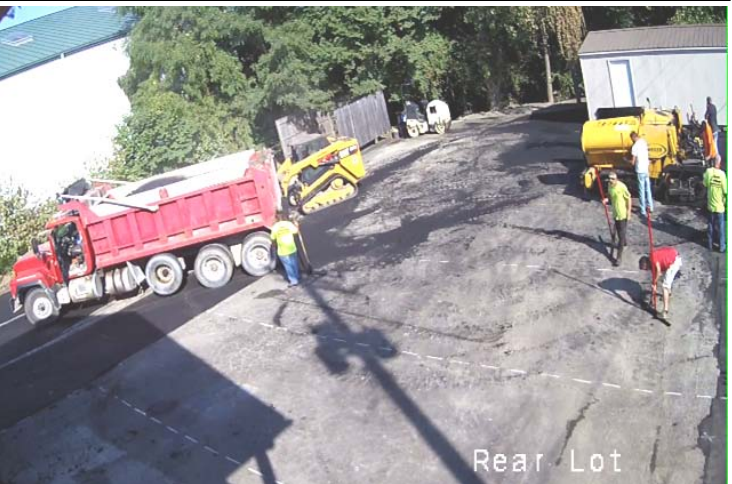
Repaving Parking Lot