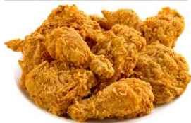
Fried Chicken Dinner 1800 - 2000