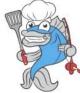
Fish Fry 1800 - 2000