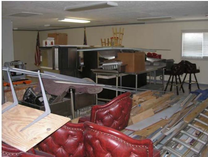
Under Construction - POST 604 Dining Room Area.

Contact the Commander or Ed Mauritsen to coordinate.