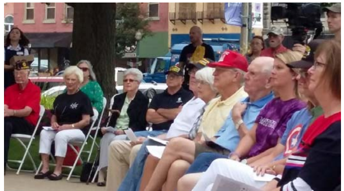
Viet Nam 50 th Anniversary pictures