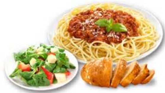
FIRST FRIDAY OF THE MONTH DINNER SPECIAL DECEMBER 5 TH