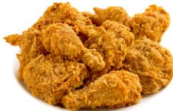
Fish Fry 1800 - 2000