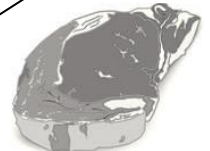
Rib Eye Steak