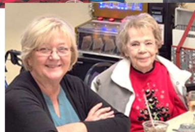
Post Christmas Dinner 2023