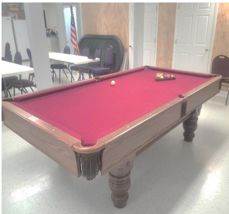
Our Pool Table is set up and ready to go.