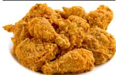
Fried Chicken Dinner 1800 - 2000