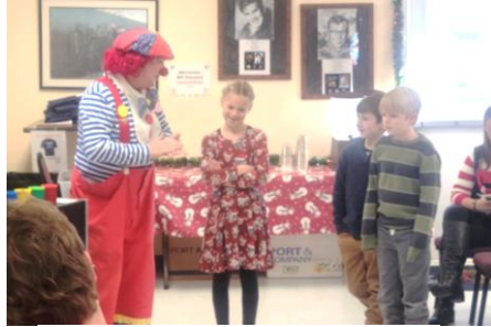
Magic from Binky with 3 helpers