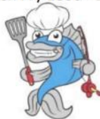
Fish Fry 1800 - 2000