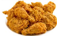
Fried Chicken Dinner 1800 - 2000